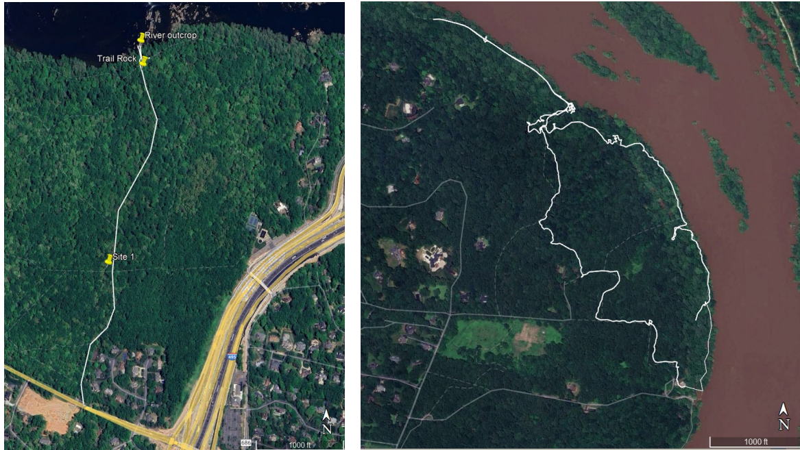
Figure 1B (left panel). Survey route and main collection sites in Scotts Run Nature Preserve. Figure 1C (right panel). Survey route at Riverbend Park.