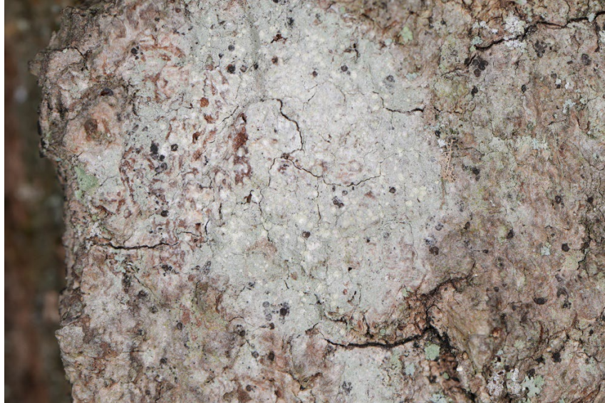
Figure 2. Two of the rare species encountered (both at Scott’s Run Nature Park), Rinodina oxydata (top) and Lecanora caperatica (bottom).

I found 80 putative species of lichens in Fairfax County on iNaturalist , including my observations. I should reiterate that I was unable to confirm or deny the identity of several of these species because insufficient evidence was provided in the observation. The iNaturalist records for lichens in Fairfax County are very incomplete. For example, common species like Dimelaena oreina , Myelochroa obsessa , Pyxine soredata , and Xanthoparmelia conspersa have only 1 record in the county. And many other common species have fewer than 5 records. I didn’t find any clear records of rare species in Fairfax County on iNaturalist but Pycnothelia papillaria is uncommon.