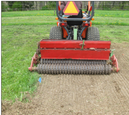
Rolling with a cultipacker (shown here) or lawn roller ensures good seed to soil contact.