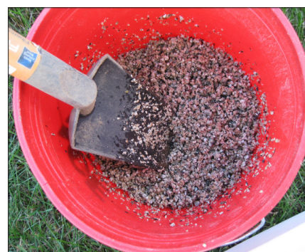
Mixing the wildflower seed with moist vermiculite keeps the seed uniformly well-mixed and easy to spread evenly.