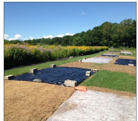
Overview of research trial comparing various methods of site preparation for killing existing vegetation before seeding a meadow mix.