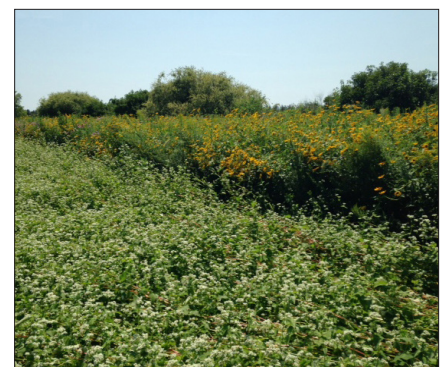
A buckwheat cover crop in front of a previously established meadow.