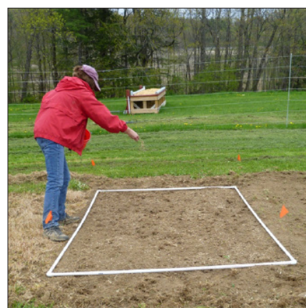
Broadcasting seed by hand over a small area.

Mix the seed with vermiculite or other carrier for one subplot at a time in a plastic paint bucket or similar container. Start with the dry carrier then add small amounts of water at a time, stirring until it is